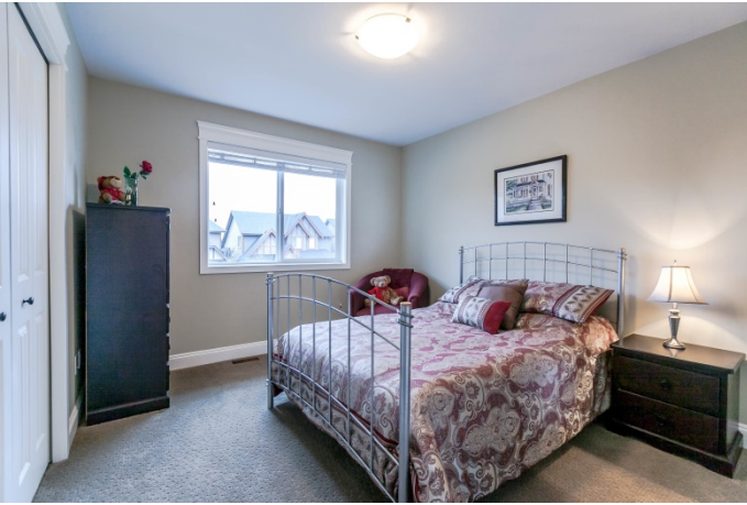
Bedroom: 12'1 x 10'6