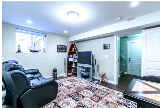
Storage Room: 8'10 x 3'8