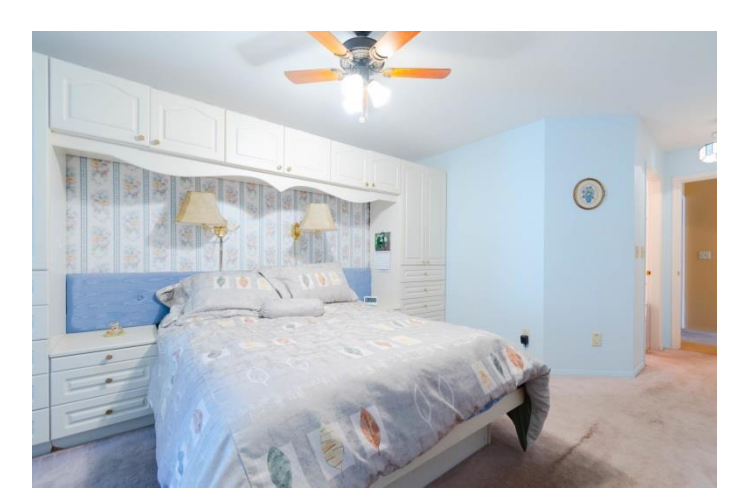
4-Piece Master Ensuite