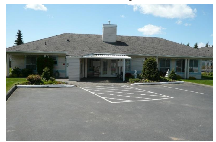
Club House ├□ Clubhouse With Lounge, Shuffle Board, Pool Table And Deck Overlooking Pond.