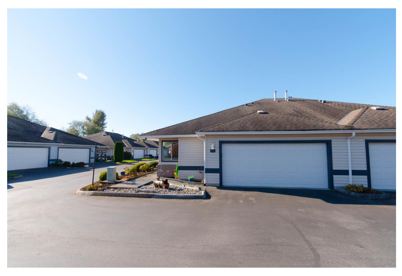
62 5550 Langley Bypass, Langley