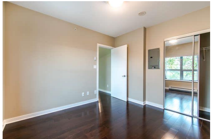
Laundry Room: 10'1 x 5'