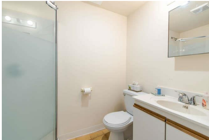
Lower Level: 1,022 Square Feet