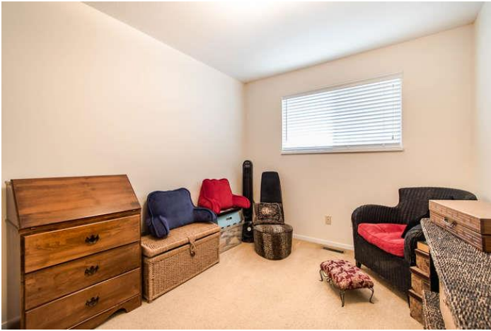
Bedroom: 11'3 x 9'1