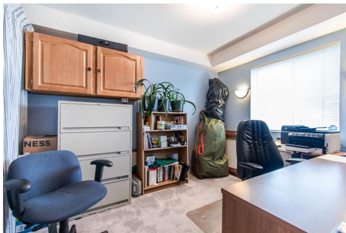
Den/Bedroom: 10' x 9'3