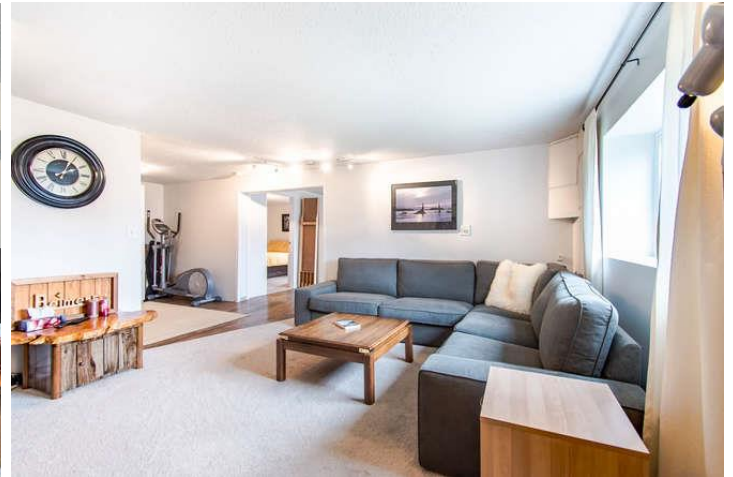
Games Room: 9'9 x 9'3