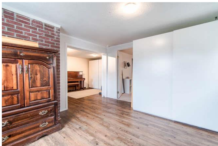
Den: 12'4 x 12'2