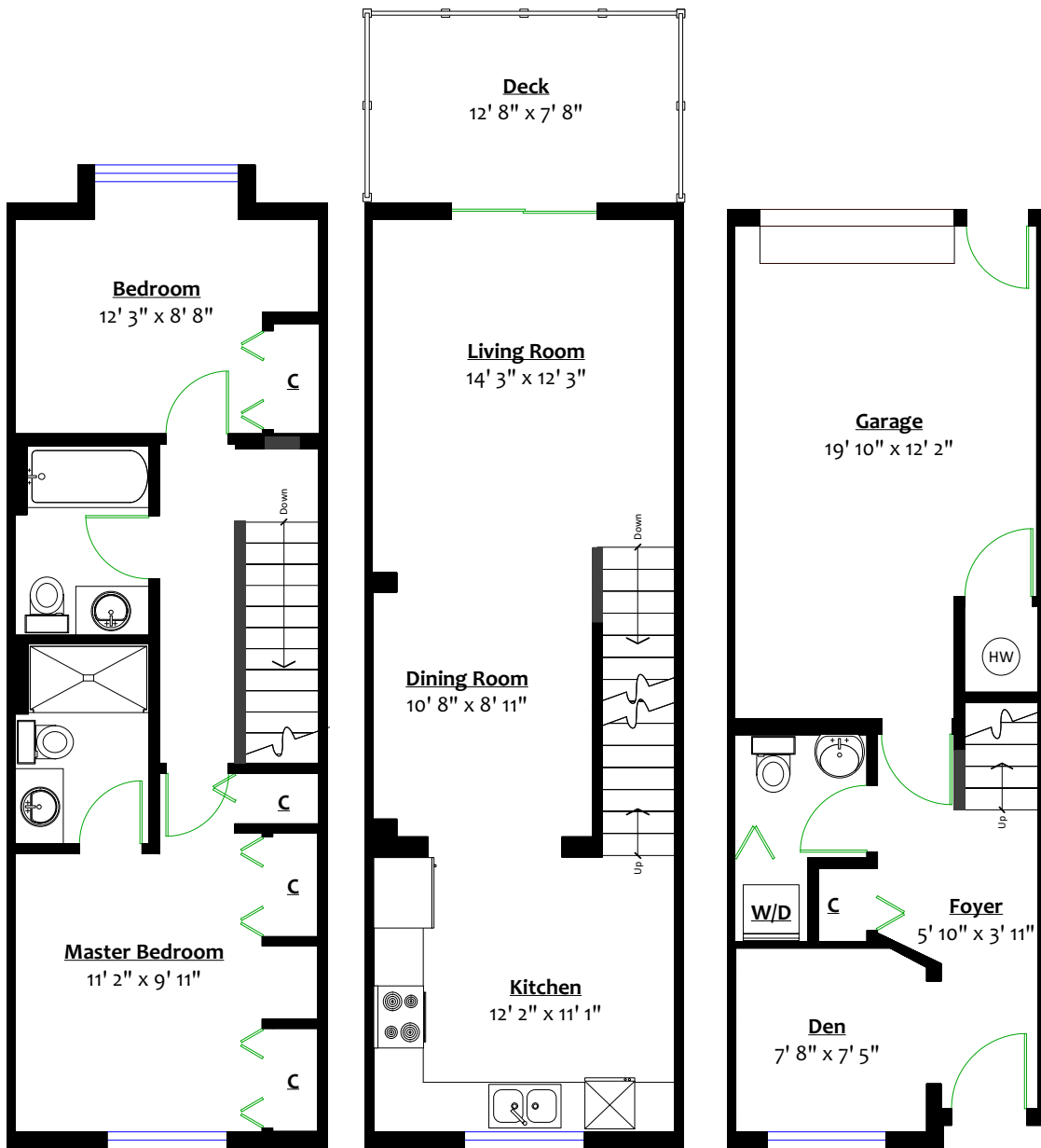
UPPER LEVEL Floor Area: 501 Sq. Ft.