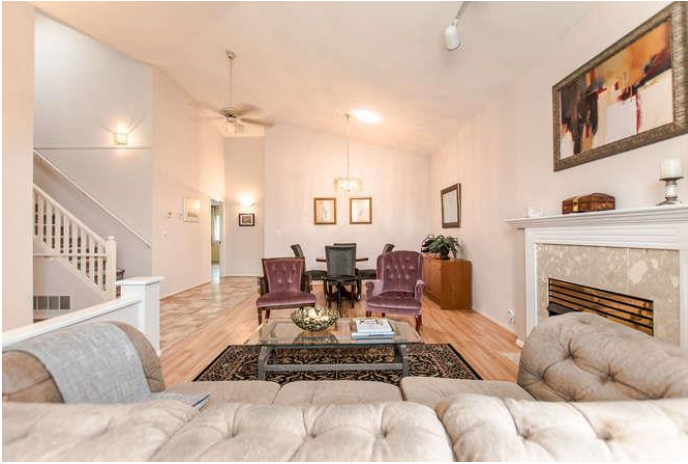
Living Room: 14'11 x 12'4