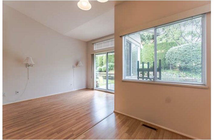
Master Bedroom: 18'9 x 11'8