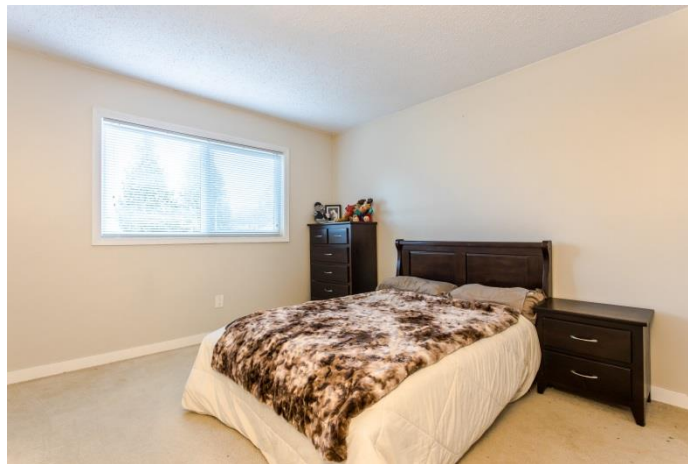
Bedroom: 10'11 x 9'