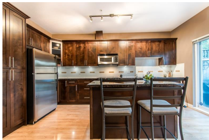
Eating Area: 9'6 x 6'8