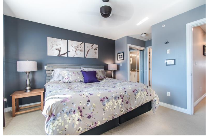
3 Piece Master Ensuite