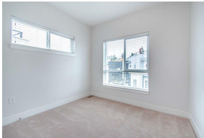
Bedroom: 13'2 x 9'