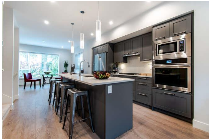
Dining Room: 14'9 x 12'