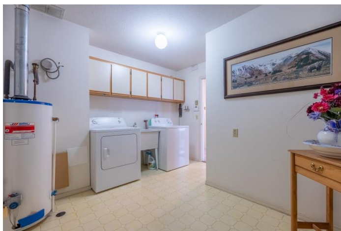
Laundry: 11'7 x 11'4