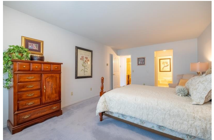
Three Piece Ensuite